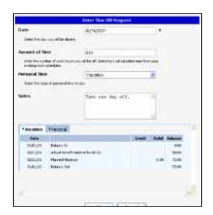
Employees request leave online using Employee Self Service (ESS). They can check benefit balances and add a note about the leave reauest.